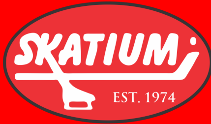
FIGURE SKATING OFFICE (610) 853-2085

VISIT WWW.DELAWARECOUNTYSKATINGCLUB.ORG FOR FIGURE SKATING & LESSONS INFORMATION